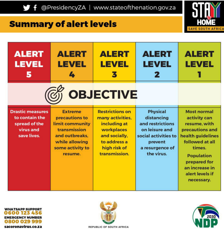
Figure 3. Government summary communication about COVID-19 lockdown restrictions alert levels

The online questionnaire was distributed using convenience sampling to a public panel via Qualtrics after obtaining ethical clearance and when pre-testing did not reveal significant problems. Given that COVID-19 was categorized as a global pandemic, coupled with the fact that the data collection happened just as South Africa moved out of level 4 in 2020, one could argue that the experience was salient and recent enough, supporting a retrospective experience approach (Harrison-Walker, 2019).