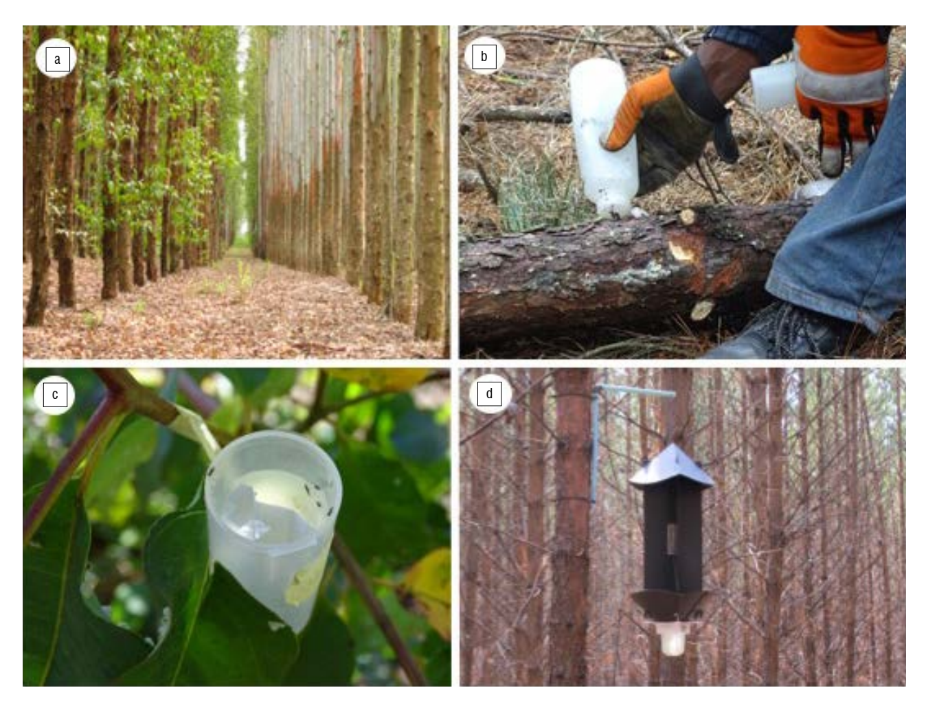
Figure 2: Management strategies for pathogens and insect pests of plantation trees in South Africa: (a) a clone of Eucalyptus grandis seriously damaged by Coniothyrium canker caused by Teratosphaeria zuluensis, alongside a disease tolerant clone, illustrating the potential benefits of breeding for resistance; (b) inoculating the nematode Deladenus siricidicola into a pine tree infested with Sirex noctilio , as part of a successful biological control programme first implemented in South Africa in 1995; (c) releases of the parasitic wasp Psyllaephagus bliteus to control the red gum lerp psyllid, Glycaspis brimblecombei ; (d) a lure-based trap used to monitor populations of S. noctilio and thus inform management strategies.

One of the reasons that plantation forestry has not been devastated by insects and diseases must be attributed to the fact that a wide variety of trees has been grown in South Africa over time, changing species and