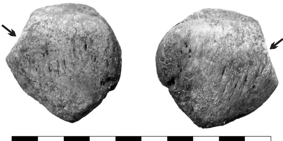
FIG. 5. Bilateral bipartition of the patellae of UP 143 (see arrows). Scale in centimetres.

(number of teeth affected: 3, number of teeth in the sample: 210). These results imply that few people had carious lesions in their mouths and of those who did only one or two teeth were affected. The number of persons affected by antemortem tooth loss (AMTL) was 22% ( n = 2 affected, n = 9 ) and AMTL intensity of 1.4% (number of teeth lost antemortem: 3, number of tooth sockets present in the sample: 215). Heavy dental wear and