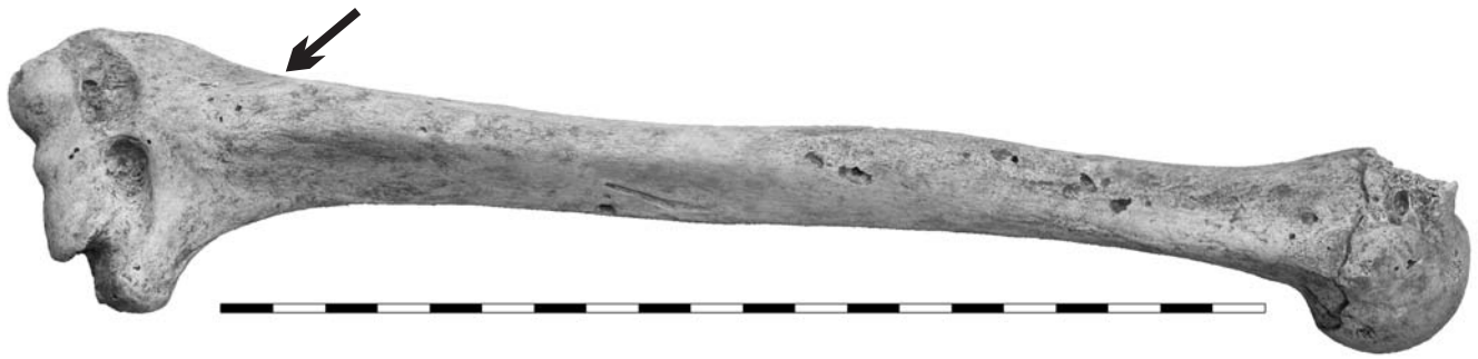
FIG. 3. Deformation of the right distal humerus of UP 51 (see arrow). Scale in centimetres.