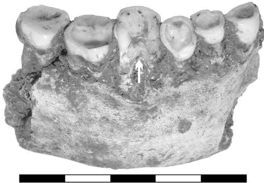
FIG. 6. Posterior part of the right mandible of UP 152: note the exposure of the root and helicoidal wear on the first molar (see arrows). Scale in centimetres.

antemortem tooth loss was recorded only in adults over 40 years of age (UP 152 and UP 153). The oldest individual (UP 152) had heavy dental wear, visible periodontal disease, and five periapical abscesses at the tooth roots of the upper first and third molar, the lower right second incisor and first molar, and the lower left first premolar. Healed abscesses were present at the root of the lower left second molar and first molar. The combination of these dental problems and possible malalignment of the upper and lower jaw was most likely responsible for both helicoidal wear and exposure of the root pulp on the lower right first molar (Fig. 6). Periapical abscesses were also noted on the lower right second premolar of UP 151 and the lower left first premolar of UP 153.