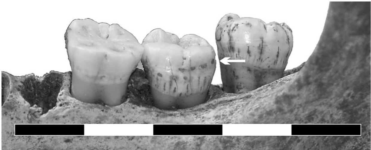
FIG. 8. Pitted enamel hypoplasia on the second molar of UP 151 (see arrow). Scale in centimetres.

trichiura or whipworm) and from the drinking water of the modern, rural Venda (1900 AD) (bilharzia) (Dittmar & Steyn 2004; L'Abbé 2005).