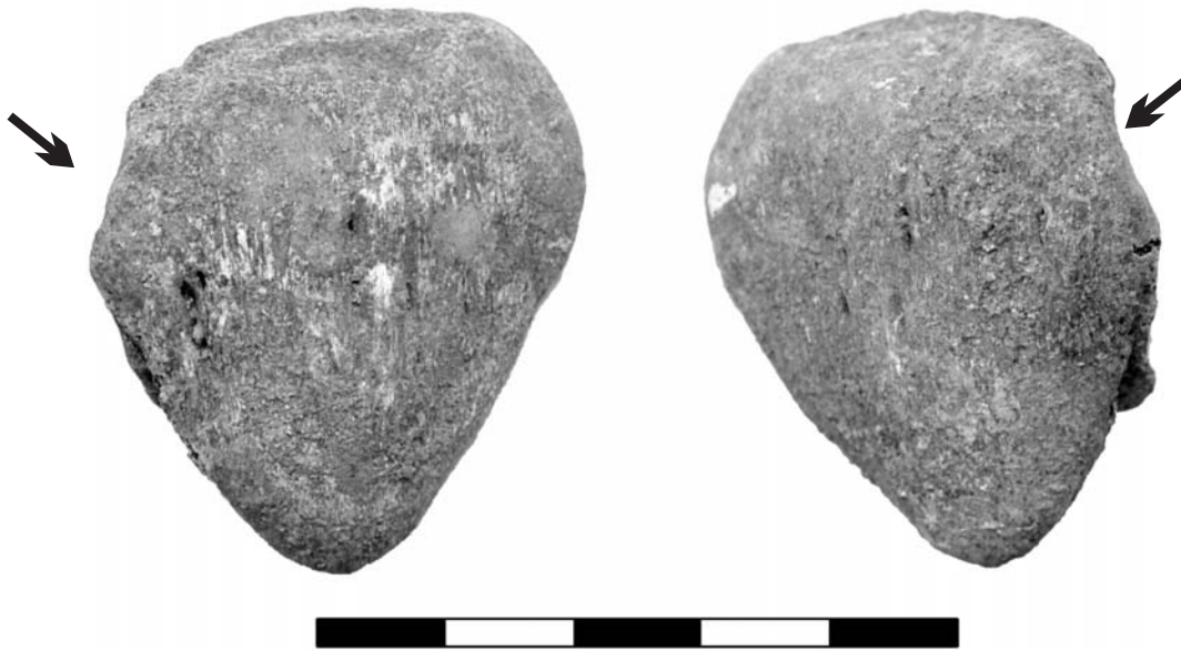
FIG. 4. Bilateral bipartition of the patellae of UP 95 (see arrows). Scale in centimetres.

bipartition of the patellae of both UP 95 and UP 143 (Figs 4 & 5). Because the condition is bilateral on both skeletons, it is more likely to have been a developmental anomaly than a traumatic condition, such as lateral avulsion of the patella.