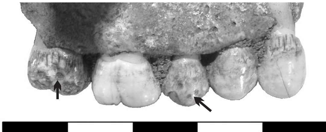
FIG. 7. Pitted enamel hypoplasia on the upper second premolar and second molar of UP 51 (see arrows). Scale in centimetres.

From the distribution of ages (Table 2), it was observed that three juveniles died during young adolescence with most of the other people dying during young adulthood (or their third decade of life). Although interpretations from these results should be approached with caution, the relatively large number of dead adolescents and young adults might reflect a group that was perhaps dying from acute infectious diseases. This is not an unrealistic assumption considering that death from acute infections was a common problem for 20th century South Africans who live in rural areas with no access to modern amenities or medical care (Van Tonder & Van Eeden 1975). Evidence for bacterial and parasitic infections in early and late Iron Age inhabitants have been recorded from a single coprolite at Mapungubwe/K2 (1000 AD to 1300 AD) ( Trichuris