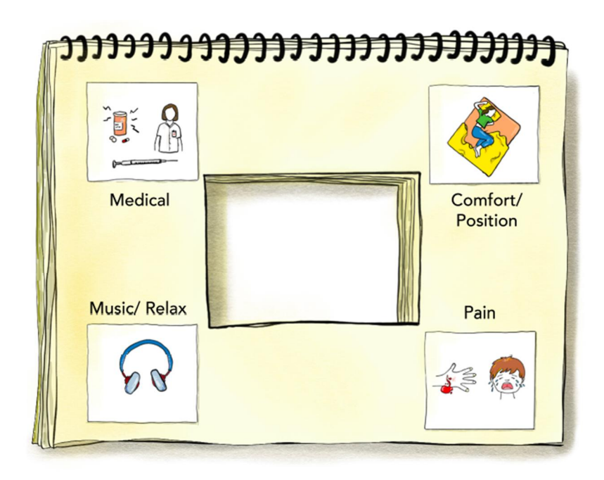
Figure 3: Eye gaze flip chart.