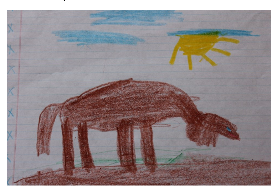
Drawing 4. Participant 12 (school 1 class 1)

'Die perdjie kalop na sy huis.' The sentence was translated by the researcher as [The horse galloped to his house].