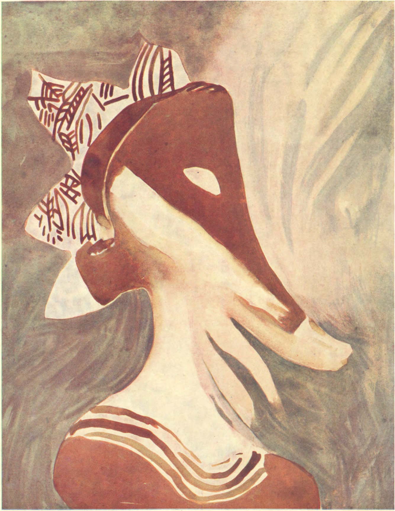
2. THE ANIMAL-HEADED FIGURE FROM SIJORA, Plate No XIII in The Artists of the Rocks . Watercolour Copy by The Artist.