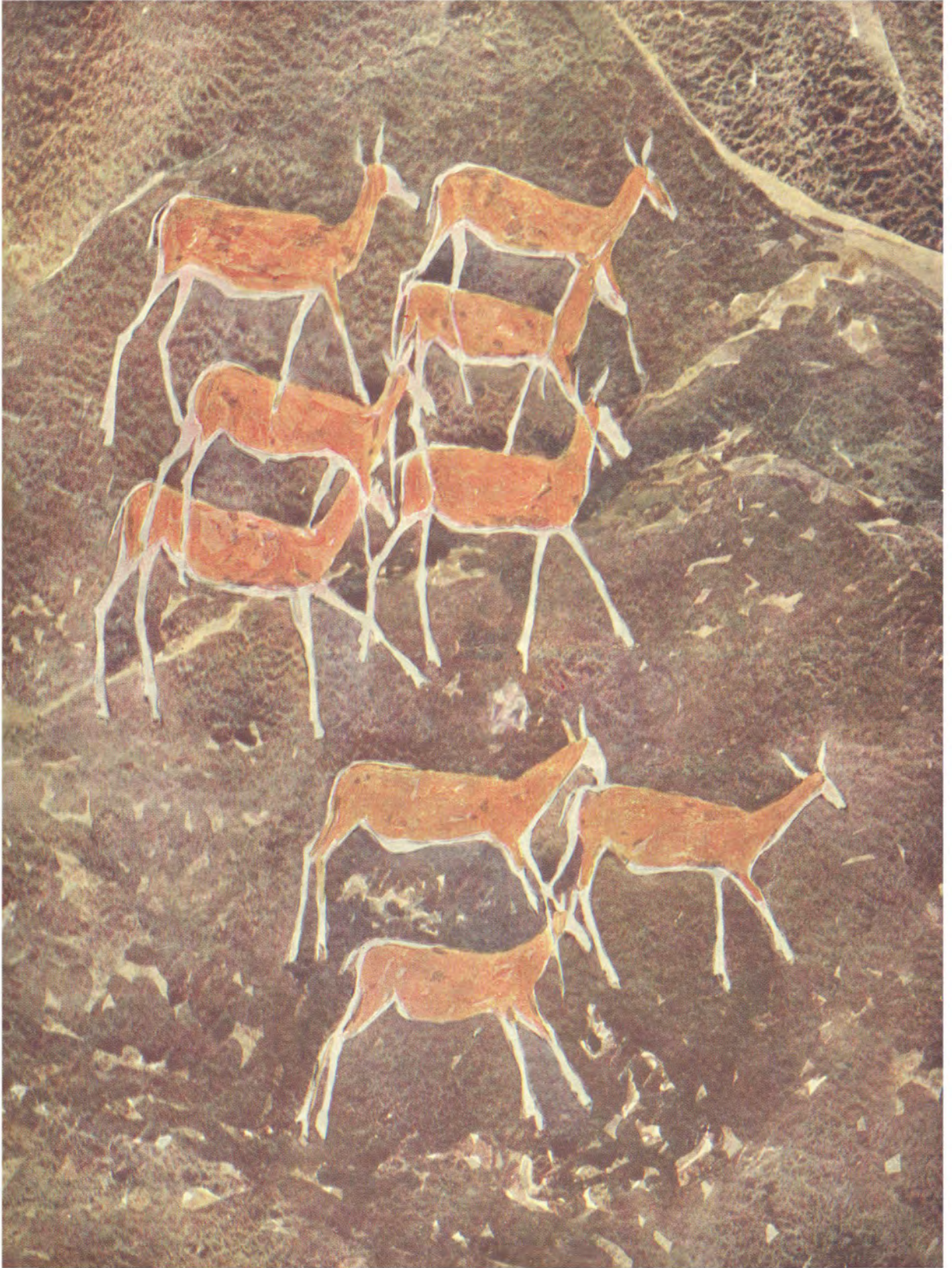
27. THE DELILA RHEBUCK. Watercolour copy by the artist. From 'The Artist of the Rocks'. Pl. II.