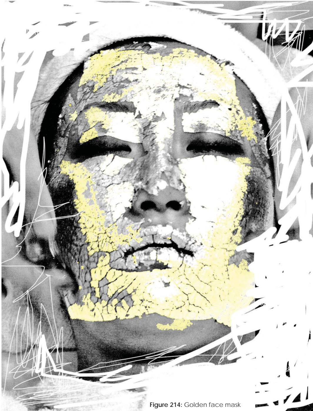
Figure 214: Golden face mask