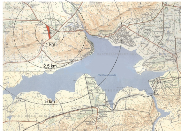
1.01: HARTBEEPOORT DAM

Before 1994 there was not much commercial development around the dam. It was a haven for mountain climbers, a few yachtsmen and boating enthusiasts and the ever popular "Breakfast Run" for motor bike enthusiasts. Water, beautiful scenery,