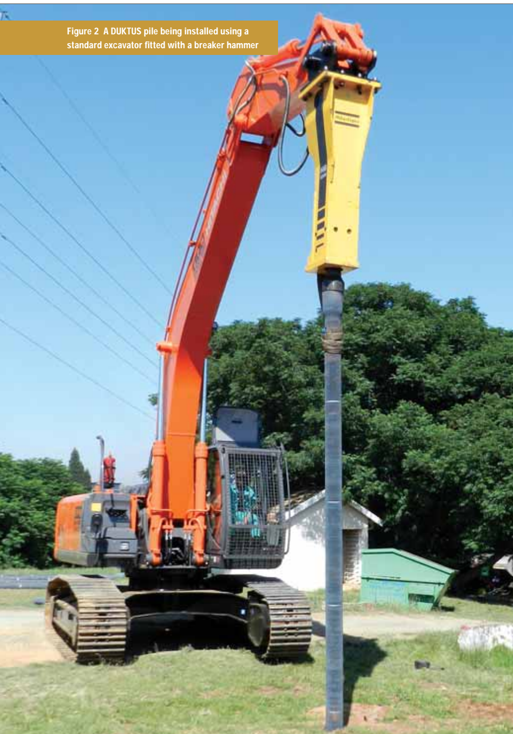
Figure 2 A DUKTUS pile being installed using a standard excavator fitted with a breaker hammer