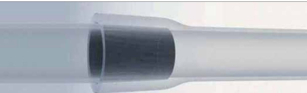
Figure 1 The lengthening of the pile is achieved quickly, safely and securely by means of a tapered frictional socket joint

The soil profile comprised a firm, silty clay from reworked residual shale to a depth of 15 m. This was followed by sandy