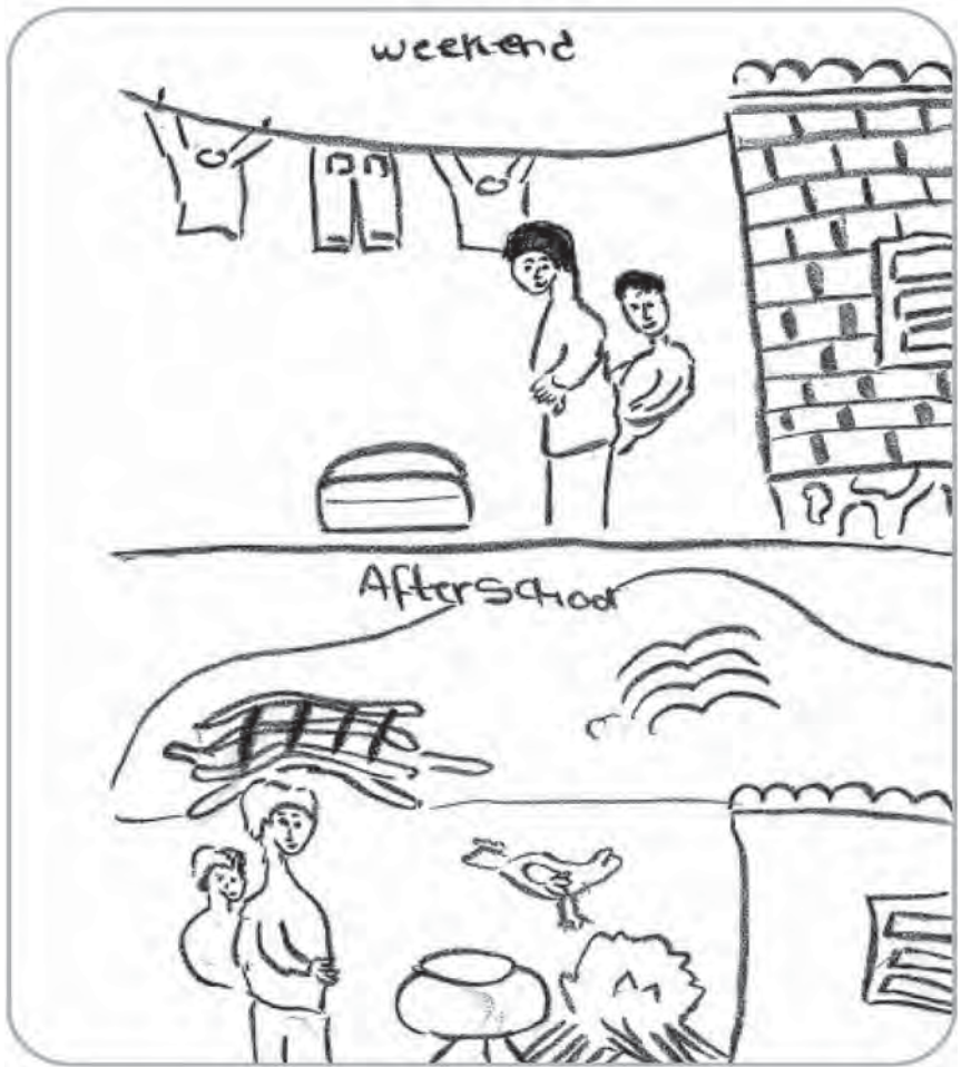
Figure 2: Second example of a child's input to the Children's Amendment Bill