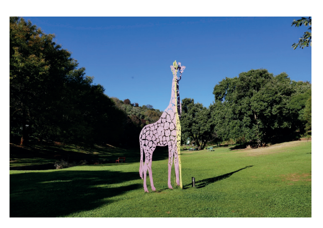
Fig. 3. Giraffe sculpture