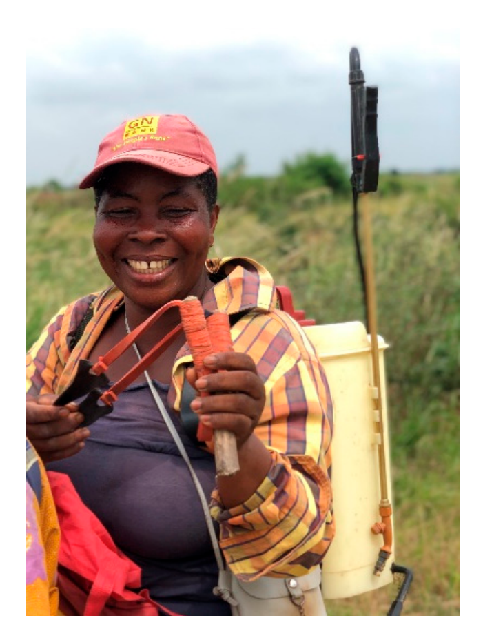
Figure 2. A female farmer demonstrates the use of the bird-scaring device (catapult) while carrying a knapsack sprayer on her back.

Using the machines listed in Table 2, various ownership models were created and assessed for their economic feasibility. For each ownership model, the full complement of equipment in Table 2 is proposed for the respective field activity, with variations only for planting methods (either transplanting seedlings or broadcasting seeds).