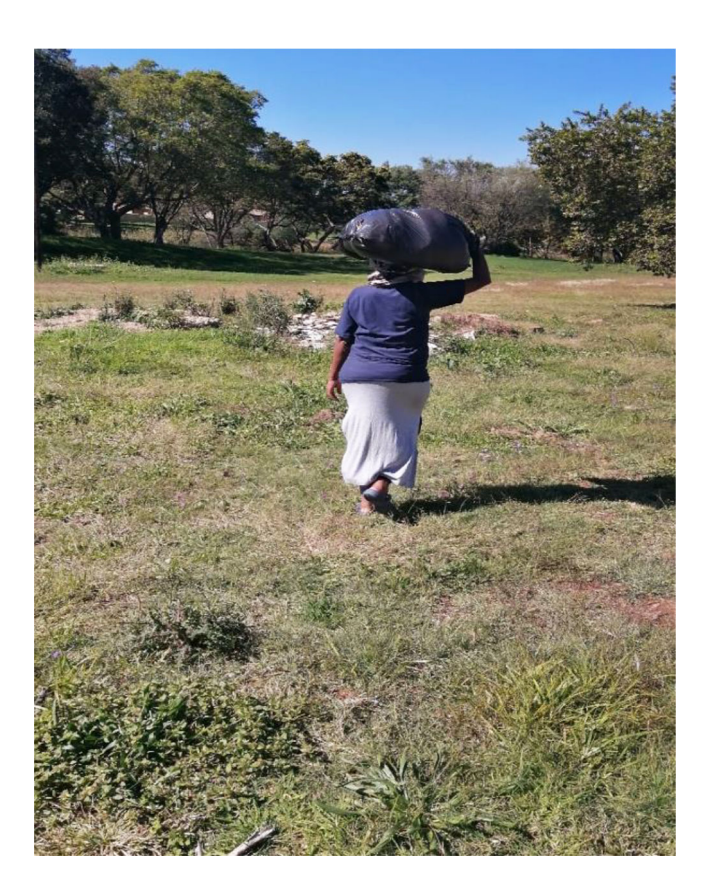
Figure 1. Woman carrying luggage.

In terms of dysmenorrhea as a process or journey, a photograph (Figure 1) was presented, which was interpreted as embarking on the health journey, but interrupted and distracted by physical and emotional pain throughout reproductive age or as a process that occurs over some time in the women's' lives. Participant #6: "dysmenorrhea builds up with time, other parts of the women reproductive system are affected". Participant #2: "when experiencing dysmenorrhea, we think of how long the person has been in this journey because symptoms increase with time".