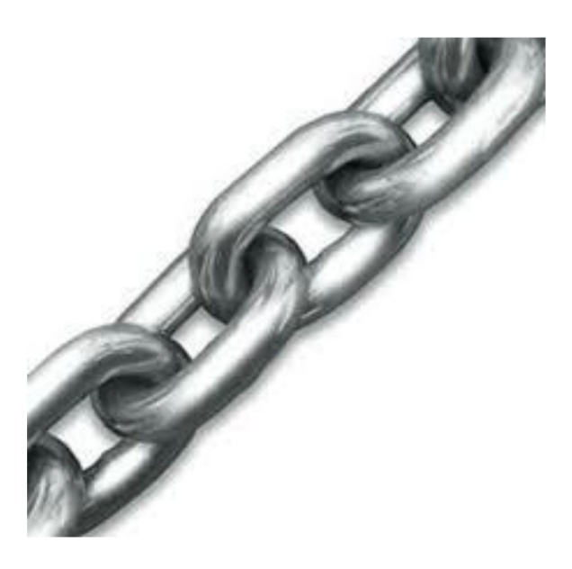
Figure 2. Chain.

The findings revealed that dysmenorrhea is not just a pain; it is seen as the bridge (Figure 3), linking the sufferer to other chronic pain conditions associated with woman's reproductive system problems.