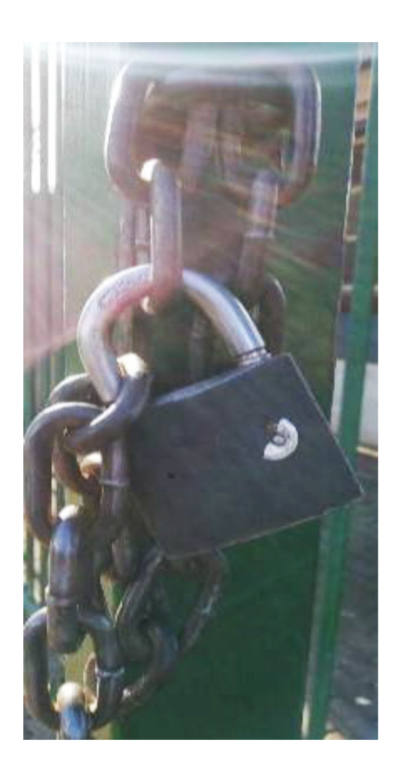
Figure 4. Padlock.