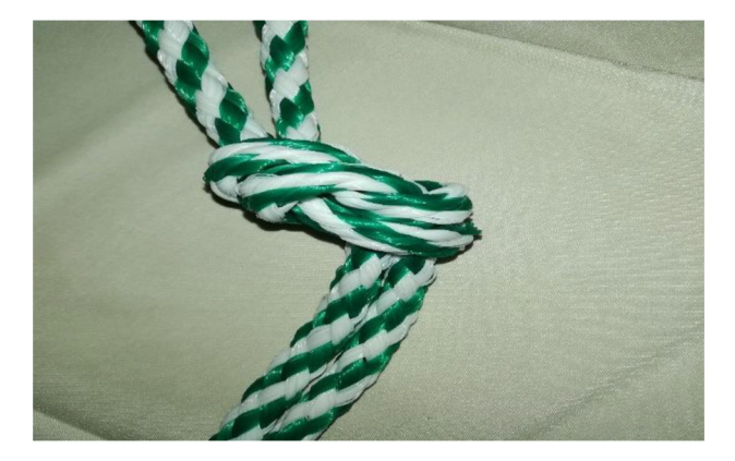
Figure 5. Knotted rope.