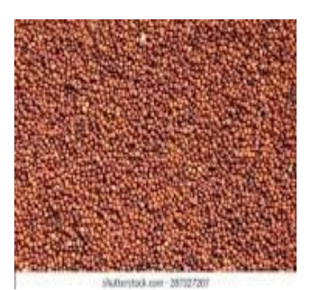
Figure 3: Finger millet (Rapoko) grains