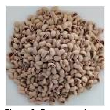
Figure 2: Cowpea grains

Finger millet was cleaned, and malting carried out according to a method detailed by [29]. Finger millet grains (2kg) were washed and steeped in a 2-litre water container for a period of 24 hours. Water was changed after every 6 h during steeping. The finger millet grains were then washed and germinated in ventilated cupboards for 2 days at an ambient temperature of 28 °C with regular sprinkling of water. The malted finger millet grains were removed and dried in an oven at 48 ± 2 °C for 24 hours. The grains were milled using an experimental mill fitted with a 500 μm opening screen to give whole grain flour and stored at 9-10 °C until further analysis. Cowpeas grains (Fig 2) were also screened, cleaned, and milled into flour. Cowpeas were hydrated, germinated, and fermented to increase nutrition quality and reduce antinutritional factors. Cowpeas were soaked for 8 hrs, germinated for about 52 hours at 25°C and fermented for 24 hours at 30°C. However, this did not affect its proximate composition of both finger millet and cowpeas.