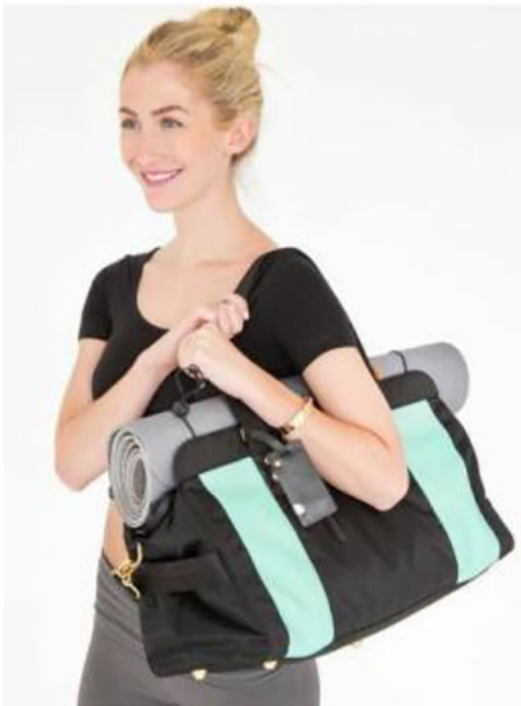
Plate 2. The Persu Bag – ease of carrying