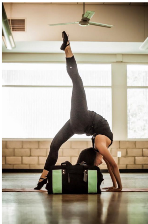
Plate 3. The Persu Bag – relative size

and video that was posted on the platform. Due to their relationship, he provided extensive emotional support.