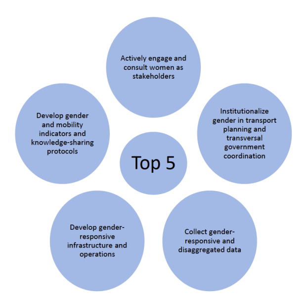
Figure 3: Prioritised themes for the South Africa gender and mobility roadmap