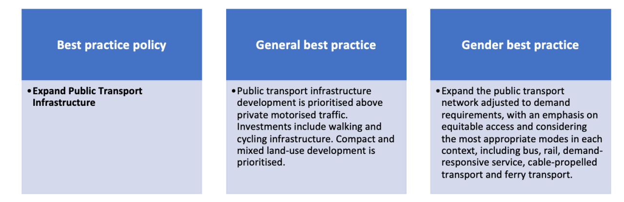
Figure 1: An example of a SuM4All GRA policy measure, with its general best practice and gender best practice

This systematic approach is based on the SuM4All's Global Roadmap of Action (GRA) (SUM4All, 2019), which lists 197 policy measures able to achieve sustainable mobility in a country. Of these 197 GRA policy measures, approximately 31 have particular relevance to gender and mobility in South Africa, and these formed the basis of the gap analysis process. The GRA includes a detailed description of each policy measure, in terms of general best practice and gender-specific best practice.