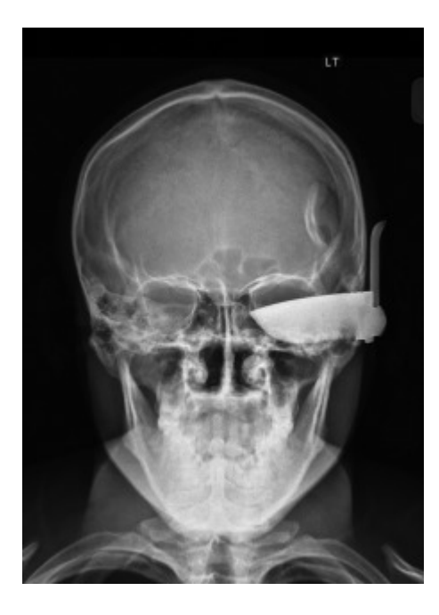
Figure 1. Frontal skull radiograph demonstrating the trajectory of the retained transcranial knife.