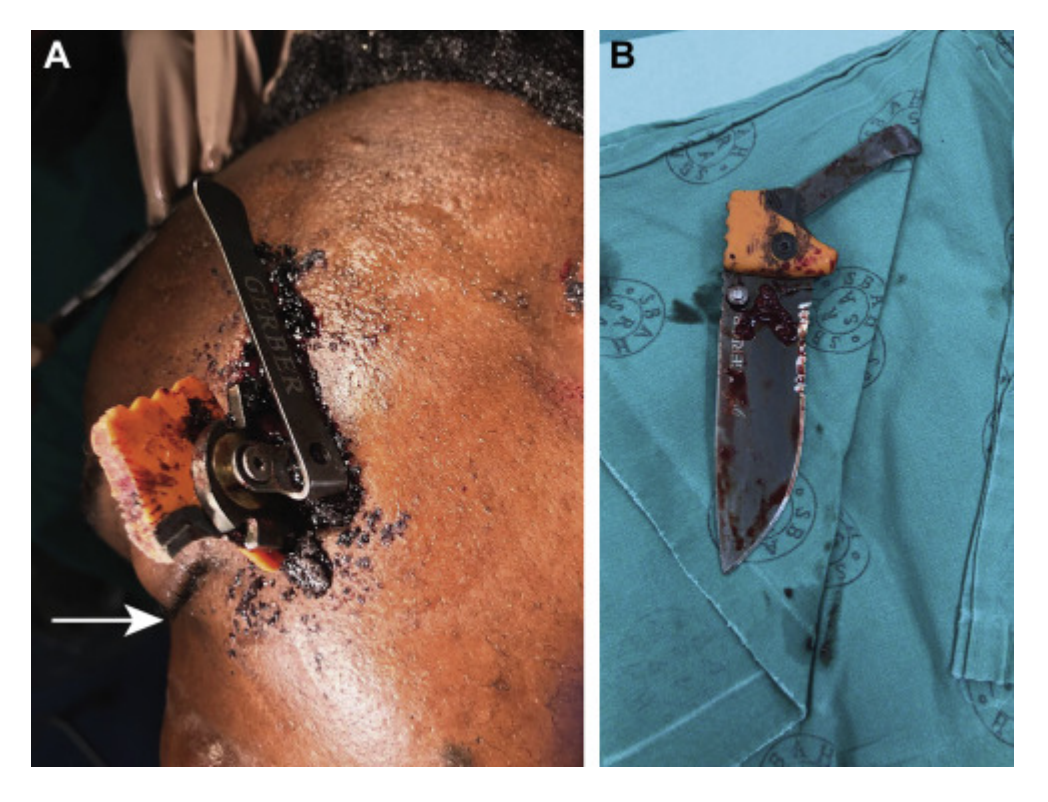
Figure 5. ( A ) Photograph of the patient before surgery. The head is shaved and turned to the right. The transcranial knife is noted posterior to the left eye (the left eye is marked with an arrow ). ( B ) Photograph of the knife post extraction.

force in the opposite direction of its trajectory (Figure 5A and B). Bleeding of the cortical vessels was cauterized and hemostasis was achieved. The defect in the dura was closed with DuraGen (collagen graft used for dural repair, Integra Lifesciences, Plainsboro Township, New Jersey, USA).