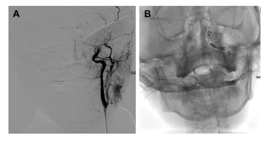
Figure 4. ( A ) Postembolization angiogram demonstrated no flow distal to the left internal carotid artery coils, which extend proximally and distally to the tip of the knife. ( B ) Skull radiograph demonstrating the left internal carotid artery coils.

Figure 3. ( A ) Digital subtraction angiography (DSA), Towne view, demonstrated focal irregularity of the left internal carotid artery against the tip of the knife ( arrow ). ( B ) DSA, Towne view, demonstrated adequate collateral circulation from the right internal carotid artery.