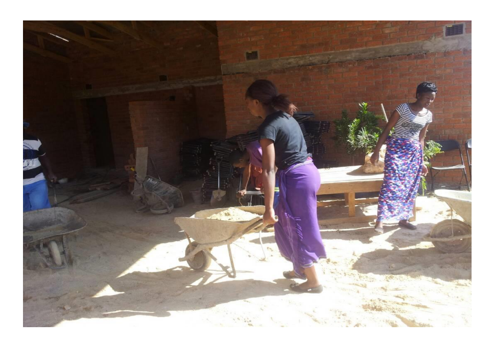
Figure 5 (Chikanga Assembly, Mutare)