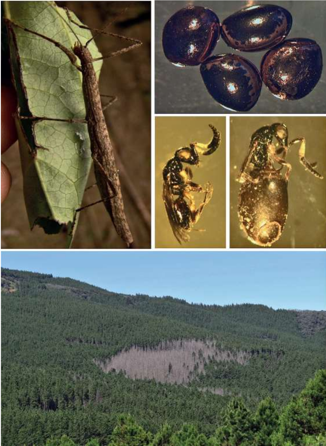
Figure 3: Litosermyle ocanae : (a) adult female; (b) eggs; (c) Adelphe sp. female; (d) emerging female of Adelphe sp. from L. ocanae egg; (e) area affected by L. ocanae in Cauca Department

Emerged nymphs of the first instar had a nymph to egg size ratio of 6:1, giving the impression that they had been rolled inside the eggs. The range of body