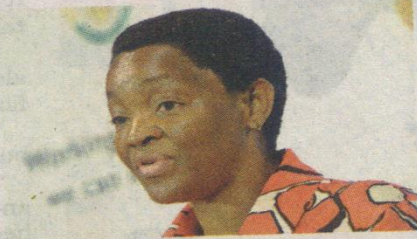
Minister Bathabile Dlamini

The proposed legislation still needs to be debated before we can discuss how to focus on developing methods to prevent the sale of alcohol to minors. But we are looking at regulating licences.