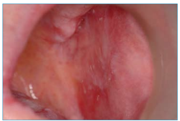
Figure 5: Left buccal mucosa demonstrating significant resolution of the ulcer but with residual erythema.

in 10% buffered formalin for haematoxylin and eosin (H&E) staining and histological examination and a fresh sample was submitted for direct immunofluorescence (DIF) analysis. A blood sample was also submitted for indirect immunofluorescence (IIF).